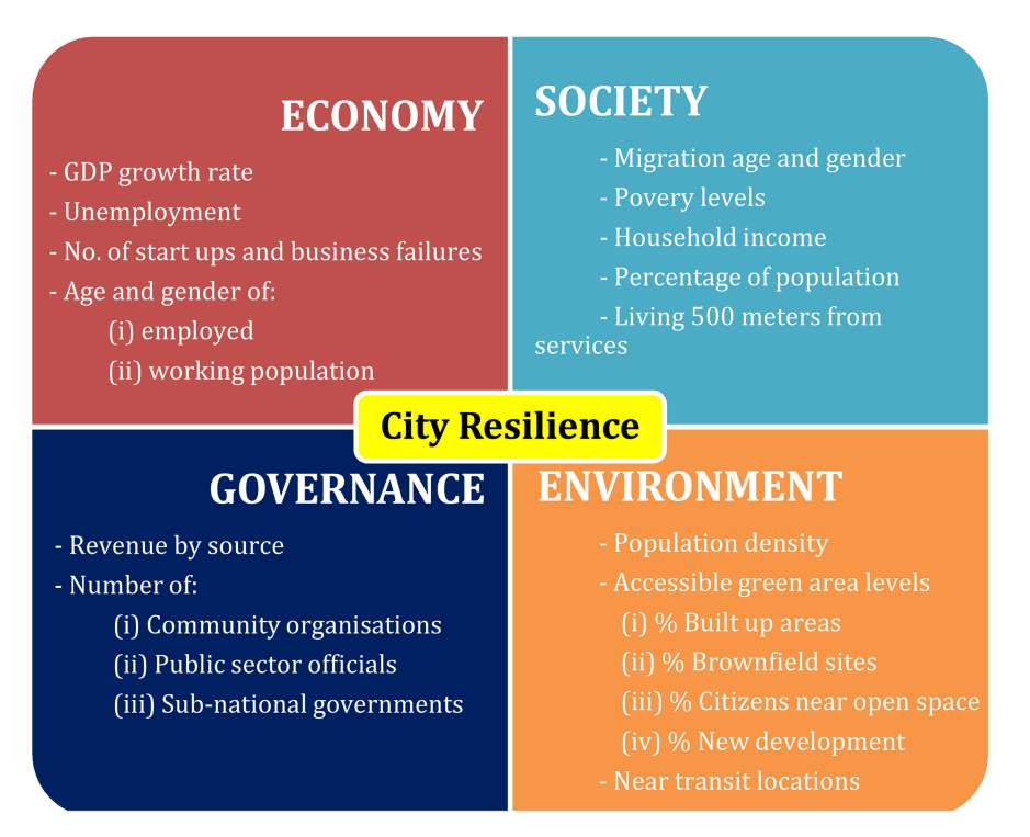
Figure 4. Measuring city resilience under four key domains of economy, society, governance, and environment (Source: Adapted and redrawing by the author from Organisation for Economic Co-operation and Development (OECD), 2019).

This study aims to reflect on early lessons for urban resilience enhancement. This is done through a brief checklist of multiple factors as shown in the next